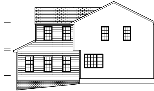
LEFT ELEVATION SCALE 1/8" = 1'-0"